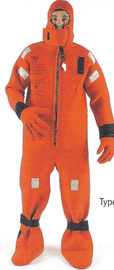
Type "C" - MED/SOLAS