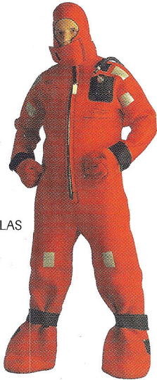
Type "S" - U.S.C.G./MED/SOLAS